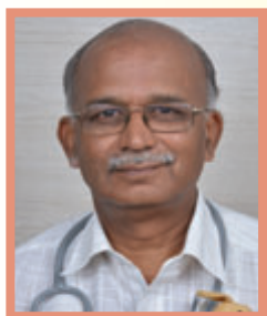
DCH, MD(PEDS), DNB, MRCP(UK)