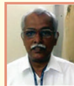
BSc, MBBS, MD, MPH, Dr PH, Dr Of Medicine- Denmark