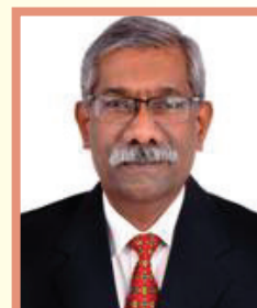
MBBS, MD, PG Diploma in Health Service Management