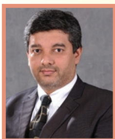
MD(PEDS), DNB(PEDS), FELLOWSHIP IN PEDIATRIC CRITICAL CARE