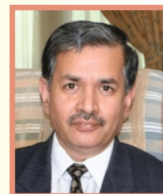
MBBS MD, MNAMS, FRCR