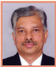
MBBS, MS, MCh, FIACTS