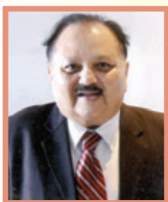
MBBS, DMRE, MD